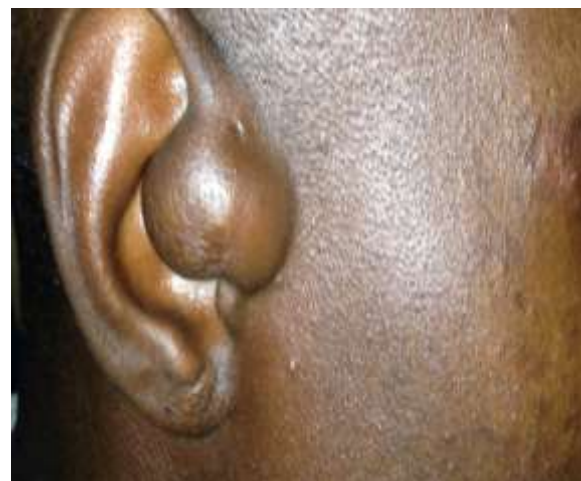
Figure 3: Preauricular sinus cyst.