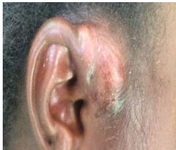
Figure 2: Discharging preauricular sinus abscess.