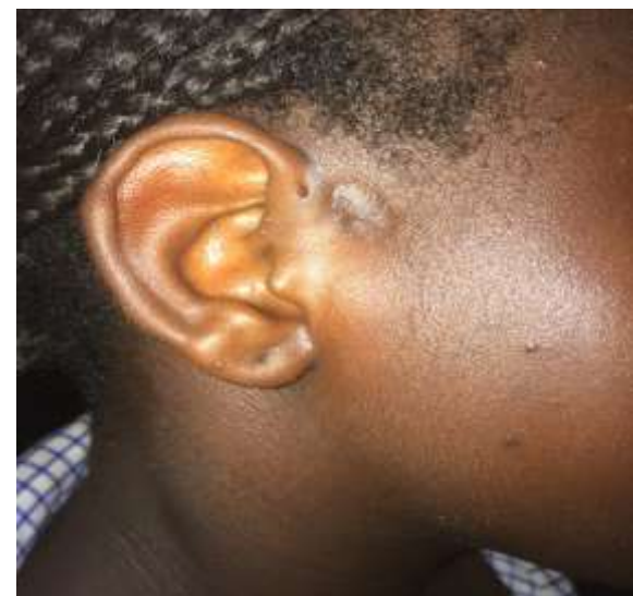
Figure 4: Healed scar of a ruptured preauricular sinus abscess.