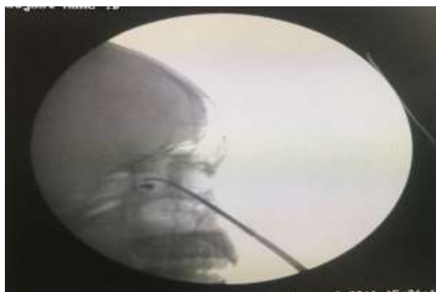
Figure 3: C-arm image–ball point pointing towards foreign body.