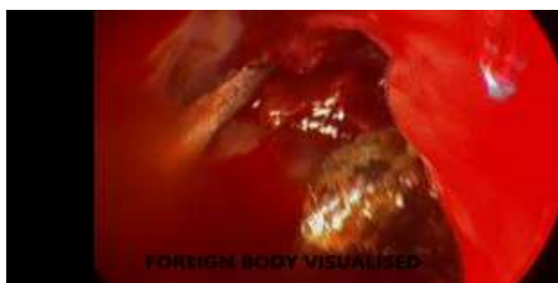
Figure 4: Intra-operative foreign body exposure.