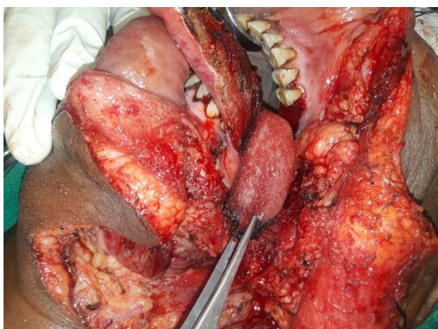
Figure 2: Posteriorly based dorsal tongue flap covering the surgical defect.